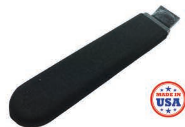
GM Rear View Mirror Removal Tool P/N: AGS-MB4