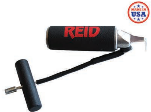
P/N: RK-500 Quick Release Cold Knife