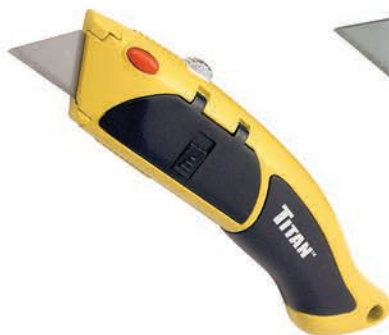
Quick-change, auto-load and ergonomic utility knife P/N: UK-HD