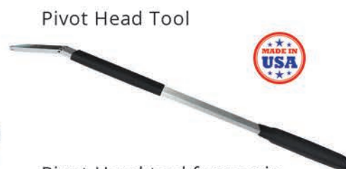
Pivot Head Tool

Flat handle knives are made from aluminum or steel bar for heavy-duty jobs. Handles are made from soft rubber for ergonomic gripping.