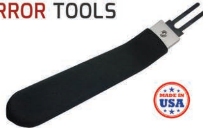
Ford Rear View Mirror Removal Tool P/N: AGS-MB3