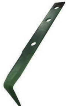
RKB-142-XP and 142-XSP has a 4" long neck and 1" blade for hard to reach areas P/N: RKB142-XP