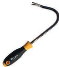
Door Panel Remover P/N: AGS-HDPR