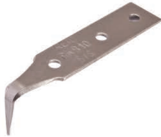
Stainless Steel Blades P/N: RKB75-S/S - 3/4" P/N: RKB10-S/S - 1.0" P/N: RKB15-S/S - 1.5"