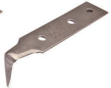
Cobra Blades provide a raised radius to relieve blade resistance P/N: RCB-175-S/S 3/4" P/N: RCB-110-S/S 1.0"