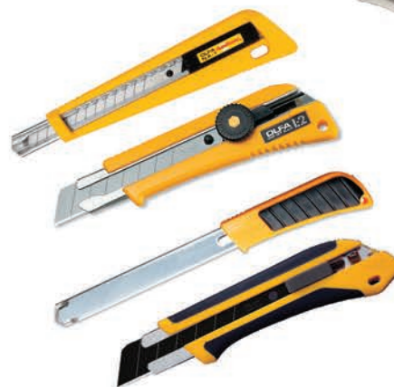
OLFA® Knives P/N: NA-1 9MM P/N: L-2 18 MM P/N: XL-2 18 MM X-Long P/N: XH-AL 25 MM