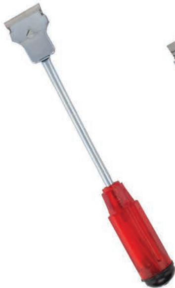
11.5" long scraper to remove stickers P/N: LRSCRAPER