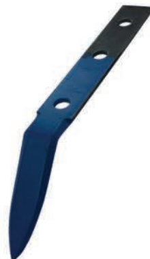
RKB-142-45 is 1.5" long blade with a 1/2" shaft bent at a 45 degree angle to assist in getting in tight corners and quarter panel glass P/N: RKB142-45