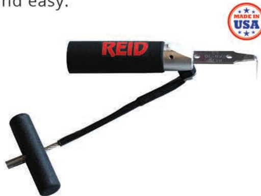
P/N: QC-200 Quick Release Cold Knife