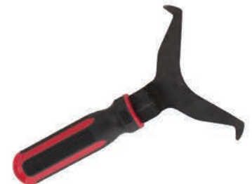
Double Mold Release Tool P/N: AGS-DBLMRT