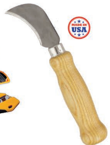
Linoleum knives are a useful tool for multiple applications P/N: UK-LINK