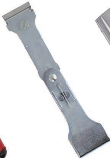
Deluxe 3-way scraper also folds together to store blade P/N: RBSDLX