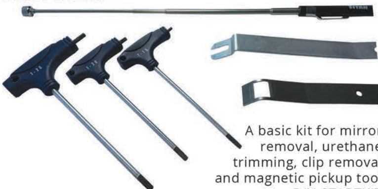
A basic kit for mirror removal, urethane trimming, clip removal and magnetic pickup tool P/N STARTKIT

Installation Sticks - double taper and chisel ends (private logo available) P/N: AGS-P101, P/N: AGS-P101C