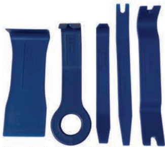
Master Remover Kit P/N: AGS-MRK