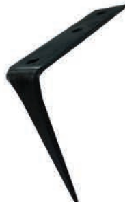
RKB-142-SP extra-long blade, at 2" long this blade reaches the deepest areas P/N: RKB142-SP