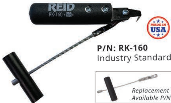
P/N: RK-160 Industry Standard