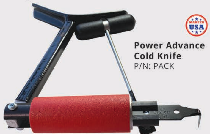
Power Advance Cold Knife P/N: PACK