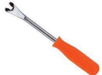
Door Panel Removal Tool P/N: AGS-DPRT