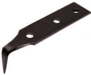
Carbon Blades P/N: RKB-146 - 3/8" Precut P/N: RKB75-C - 3/4" P/N: RKB10-C - 1.0" P/N: RKB15-C - 1.5"