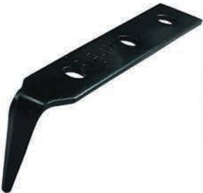
RKB-141, original cold knife blade with a 1/2" shank P/N: RKB141