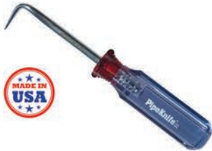
Wilde Hook Tool P/N: AGS-HT