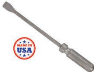
Solid Metal Gasket Scraper P/N: AGS-GL100