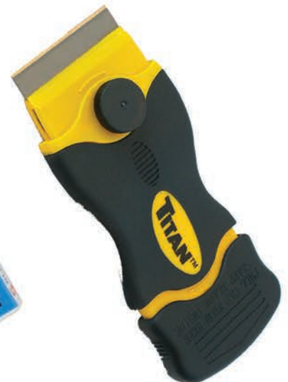
Composite mini scraper - extra strong P/N: MINISCRAP