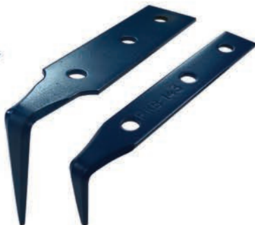
RKB-142 and 143 blades have Teflon® coating to reduce blade drag and protect against paint scratching P/N: RKB142, RKB143