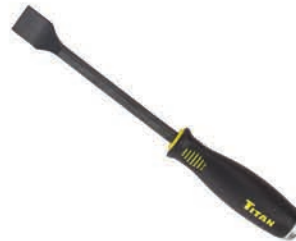
11" Gasket Scraper P/N: AGS-GS