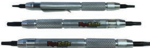
Torx Pocket Screw Drivers P/N: TORX