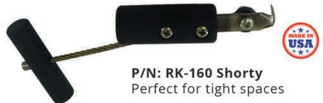
P/N: RK-160 Shorty Perfect for tight spaces