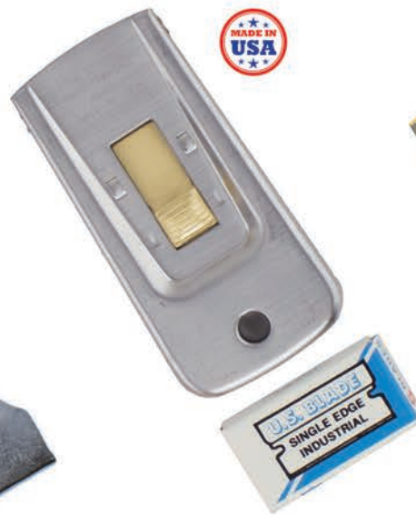
Heavy-duty hand scraper w/ 5 blades P/N: RBSCD