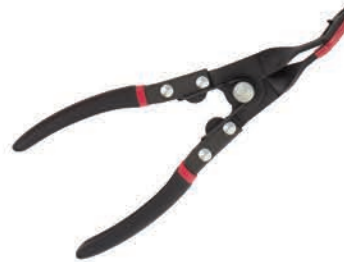
Wiper Arm Removal Tool P/N: AGS-WIPER