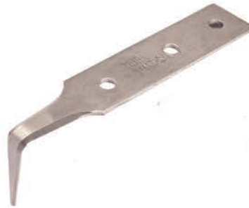
Extended Shank Stainless Steel P/N: RKB-410-S/S 1.0" P/N: RKB-415-S/S 1.5"