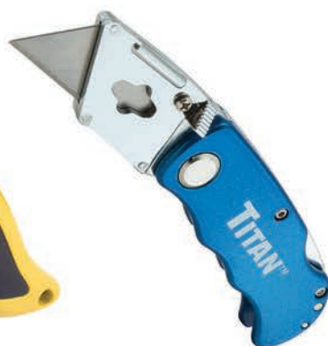
Quick-change folding utility knife P/N: UK-TITAN